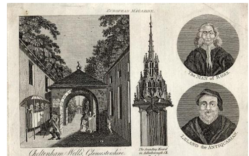
Print from 'The European Magazine', 1786.

The earliest known prints of Cheltenham are two copper plate engravings of the Original Well and Well Walk, which were published in February 1786 to accompany the second edition of Simeon Moreau's Guide to Cheltenham Spa . Also in 1786, The European Magazine published a view of the Well, while the earliest known print of St Mary's, the town's medieval parish church, dates from 1787 and was produced as an illustration for Richard Bigland's Gloucestershire Collections .