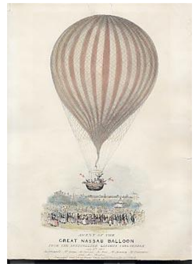
Balloon ascent in Montpellier Gardens, 1837.

The prints provide important evidence for the appearance of the late 18th- and 19th-century town, and include many buildings that have since been altered or demolished. Amongst the largest groups are views of the town's spa wells, street scenes (particularly of the High Street and Promenade), many of its villas and terraces, and its public buildings, including churches. Other prints show well-known local residents, and significant occasions in the life of the town, including the visit of King George III in 1788 and a series of events held between 1837 and 1860, such as balloon ascents, parachute jumps, political banquets and gala fetes. The collection also includes a