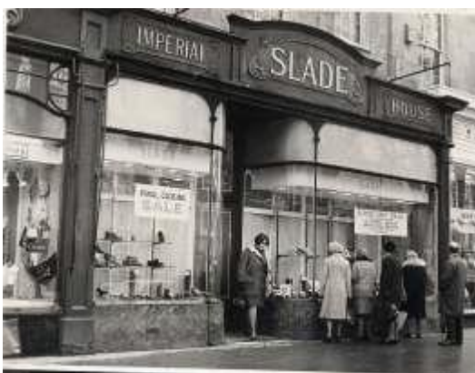
Slade's shortly before its closure in 1971

By the 1950s Cheltenham society was changing; Slade's traditional customer base was shrinking, and the new Cheltonians who came to work in the town's light industry or the Civil Service were more likely to shop in the High Street than the Promenade. It seemed that Slade's had outlived its time. In 1968 management of Slade's outfitting department at no. 76 was transferred to Messrs Gieves, with the Slade name over no. 78 only.