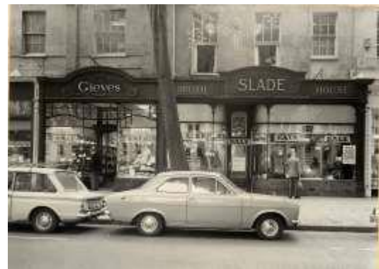
The Slade shop in around 1960's

In 1916 the firm expanded into hosiery and other menswear, taking over the adjacent premises at 11a Promenade Villas (76 Promenade) for this department. The main business however continued to be the manufacture and sale of bespoke boots and shoes; shoes which were still designed and made on the premises until 1966.