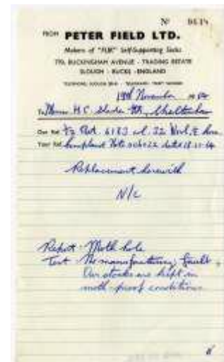
Invoice for replacement of damaged socks, despite "moth-proof" conditions

purchases, shirts were returned for new collars or cuffs, gloves for re-lining. The customer was (nearly) always right, though one manufacturer refuted the suggestion that a pair of socks could have left their moth-proof premises with a moth-hole; nevertheless they sent a replacement. To suit a customer's convenience, orders might be delivered to a home address; a single item of knitwear or a pair of socks could be packaged and sent to a customer in Upton St Leonards, Banbury or Buscot. A bishop had two shirts re-collared and forwarded to him at his holiday home on the Isle of Mull.