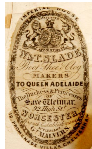
The label from a Slade product

Boots and shoes were designed and made in the rooms above the shop, and Slade's offered a custom-fitting service, with individual lasts (a wooden copy of a human foot) kept for each customer. They boasted that they could provide footwear "for dancing to deer-stalking". When Queen Adelaide, the consort of William IV, was staying at Witley Court in Worcestershire, Slade's were proud to design for her