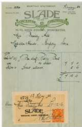
An invoice receipt for a pair of riding boots

The museum holds a large number of business documents from the menswear department, dating for the most part from 1963 - 1964. Most are working documents used in day to day processing of stock and orders, insubstantial carbon copies containing only the briefest of information. Individually unimpressive, taken together they show the range of Slade's stock, the wide selection of suppliers and the level of service offered.