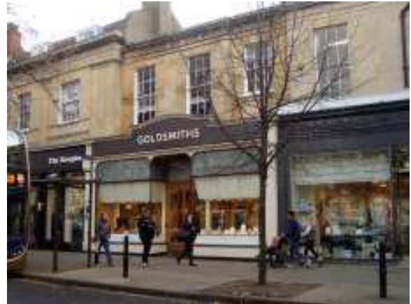
The location of Slade's shop, photographed in 2014