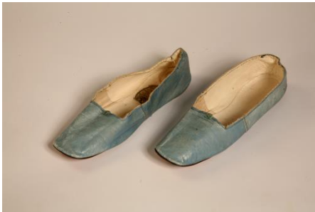
Women's shoes 1830-40

"a new and improved clog, manufactured expressly for her Majesty". A plaque recording this royal patronage used to be on display in the store, and is now held by the museum. Until 1960 Slade's made boots for the Royal Canadian Mounted Police, and soft suede 'chukka boots' for the Indian Army. These light boots were also adapted for use by the British forces fighting in the North African campaign of 1940 – 1943, and after the war 'desert boots' were widely popular.