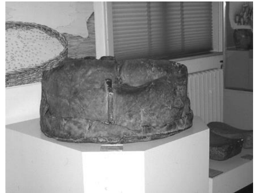
Roman lead water cistern from Bourton on the Water.