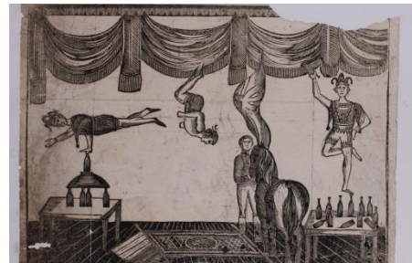
Illustration from a playbill, early 19 th century

During its time, the Theatre Royal attracted audiences and performers as distinguished as any at the Drury Lane and other famous theatres in London. The playbills (a few even printed on silk) provide a glittering 'who's who' of dukes and duchesses, earls and countesses, and lords and ladies, including such prominent visitors to the town as the Duke of Wellington and Lord Byron. The list of performers they came to see was no less illustrious: Sarah Siddons, Dorothy Jordan (mistress of the Duke of Clarence, later William IV) and the clown Joseph Grimaldi were among those treading the boards of the Theatre Royal. The playbills also highlight the appearances of juvenile performers such as, in 1830, the 'juvenile prodigy' Master Burton, aged only 7, and William Betty who was 16 in 1807.