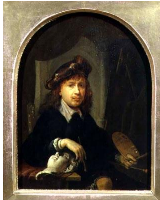
'Self Portrait' by Gerrit Dou. Oil on panel circa 1650. This was one of the 43 paintings given to The Wilson by the third Baron de Ferrières

To find out more about the collections held by the museum contact: Collections Team, The Wilson, Clarence Street, Cheltenham GL50 3JT