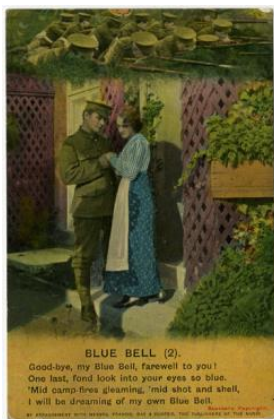
Bluebell' card No. 2

The image of a young hero going off to war for king and country was familiar on wartime postcards.