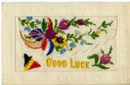
Embroidered card showing the Allied countries

Another range of postcards which are found in the Wilson's collection are a series of silk embroidered cards. First produced in the early 1900s, they became immensely popular during the First World War providing a stark contrast to the reality of the situation. Made by French and Belgian women, a design was copied many times onto a long piece of silk. The silk was then sent to factories to be cut and mounted onto card. They covered a range of topics and, as demand for them increased, the entire production was moved to Parisian factories. It is estimated that as many as 10 million of these cards were made. Some included a pocket where a small card