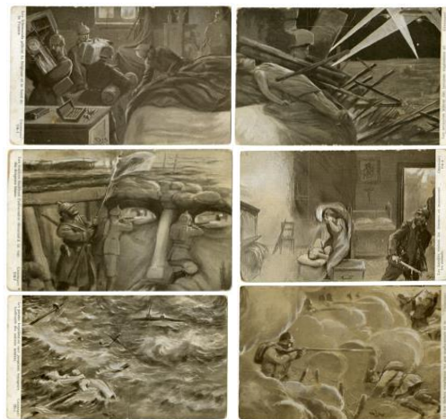
Six postcards from the collection showing the face of the Kaiser

Postcards became an effective means of propaganda. The destruction of France and Belgium were pictured and distributed within days of the first invasion. Images of 'German atrocities' were common, showing Germans as monsters who would kill men, women and children. One such example in The Wilson's postcard collection is a series of six cards which, when arranged a certain way, reveal the face of the man behind it all. Postcards were also used to ridicule Germany and the Kaiser.