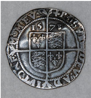
Reverse side of a shilling minted during the reign of Queen Elizabeth I (1558–1603)

In 1645 England was at war. The English Civil War had been underway since 1642. Gloucestershire saw significant fighting around this time with both Cirencester and Gloucester being besieged. In 1643 Sudeley Castle (just one mile away from where the coins were discovered) was under siege. On this occasion the castle's forces were away so the castle was taken by Parliamentary forces in just two days – although they soon abandoned it. A year later, in 1644, Sudeley Castle was laid siege to again by Parliamentary forces, however this time more serious fighting took place causing significant damage to the castle and outbuildings.