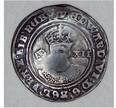
The obverse side of a shilling minted during the reign of Edward VI (1547–1553)

The overall worth of the hoard would have been £12, 15 shillings, seven and a half pence. Using the National Archives online currency converter it suggests it would have been equivalent to 182 days wages for a skilled worker in 1640. The calculation isn't an exact measure but it suggests that this hoard represents significant spending power. Since the hoard has a wide date range and many of the coins – from all periods – show significant wear from usage, the coins may have been collected over a long period of time. It is appropriate therefore to conclude that the hoarder had been saving money for a number of years from the early part of the 17th century and was possibly a person of modest means.