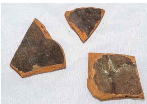
Three sherds of pottery recovered with the hoard

The hoard comprises of 251 coins all dating from the mid-16th to mid-17th century including examples from the reigns of 5 monarchs: Edward VI (1547–1553), Mary (1553–1558), Elizabeth I (1558–1603), James I (1603–1625), and Charles I (1625–1649), thus covering a period of just less than 100 years. The coins cover a number of denominations including the shilling, sixpence and half-crown. Three Scottish coins were also recorded in the hoard: one thistle merk and two 30 shilling coins. These would have been accepted in England, but were circulated at a lower rate. It's not uncommon to find Scottish coins in English hoards of this date.